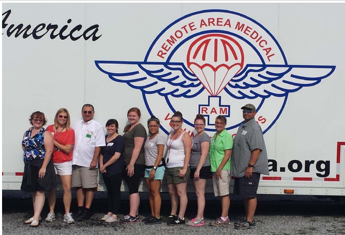
2015 Wise RAM OAV Reynolds Team